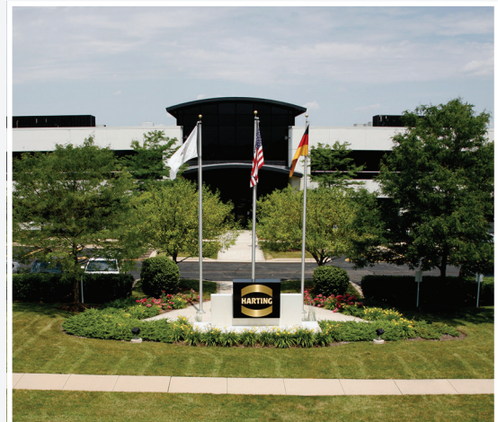
HARTING, Inc. of North America in Elgin, IL