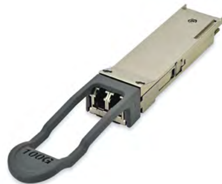
Figure 3: 100G SWDM4 QSFP28 Transceiver

Besides extending the reach, an additional benefit of upgrading to OM5 multimode fiber is future-proofing the fiber infrastructure for future 200G/400G/800G multimode interfaces suitable for the data center which may take advantage of SWDM technology.